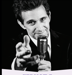
I'M NOT A COMEDIAN... I'M LENNY BRUCE SAT JUN 28 | 7:30PM