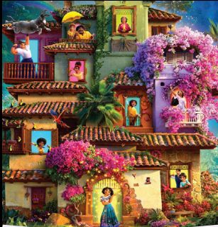
ENCANTO SING ALONG SAT APR 26 | 7:00PM