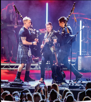
SKERRYVORE WED MAR 26 | 8:00PM