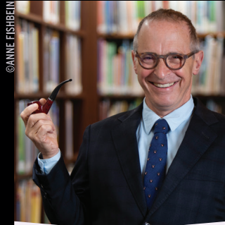
AN EVENING WITH DAVID SEDARIS MON MAY 12 | 7:30PM