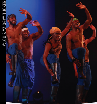
STEP AFRIKA! SUN APR 13 | 7:30PM