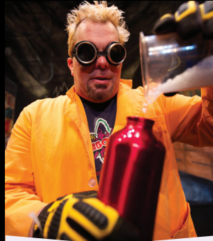
DOKTOR KABOOM! SAT APR 26 | 10:30AM